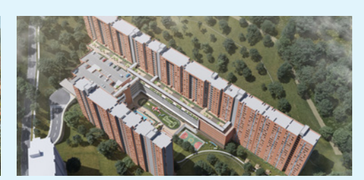
Riovivo – Arconsa